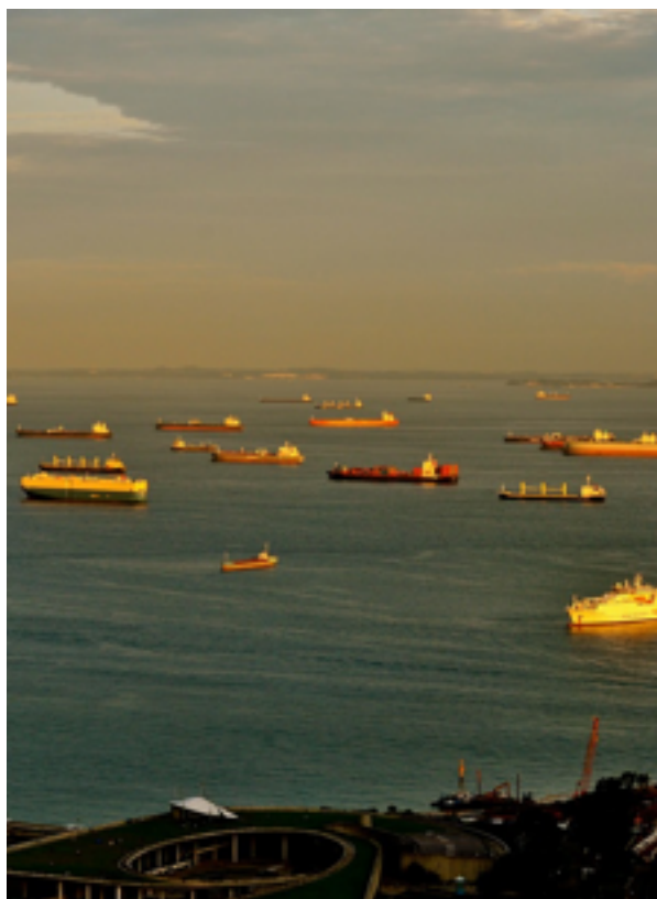
Ships waiting, drifting in the SOMS are vulnerable

6 -Three robbers boarded a product tanker underway and entered into the steering room at 2200 LT in position 01:06N – 103:44E, around 0.92nm ESE of Pulau Takong Kecil, Indonesia. Duty crew noticed the robbers, raised the alarm and crew mustered. Upon hearing the alarm and seeing the alerted crew, the robbers escaped. A search was carried out. Nothing reported stolen. Authorities informed about the incident Reported (IMB) 21 Aug.