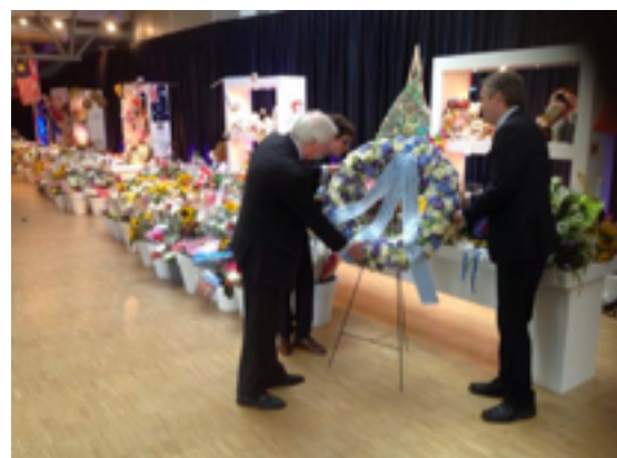
Wreath laying ceremony by UN Security Council was at #MH17 memorial at Schiphol Airport