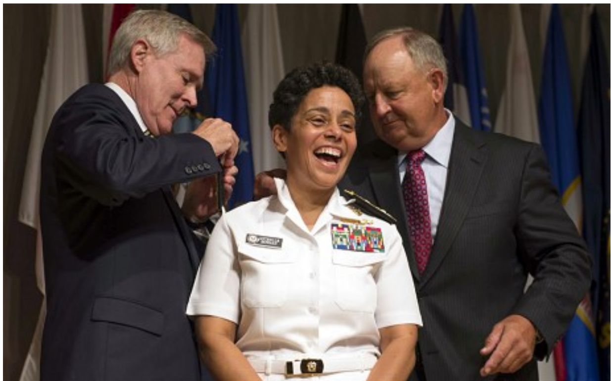
Image: Michelle Howard was the first black American woman to command an American warship, the USS Rushmore