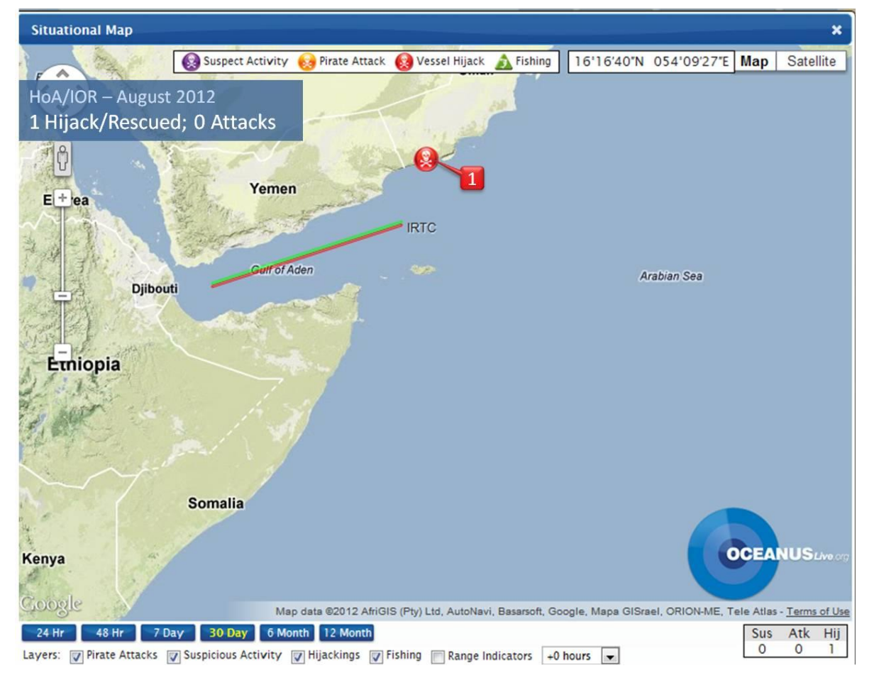
Fig 1: Horn of Africa/Indian Ocean Region