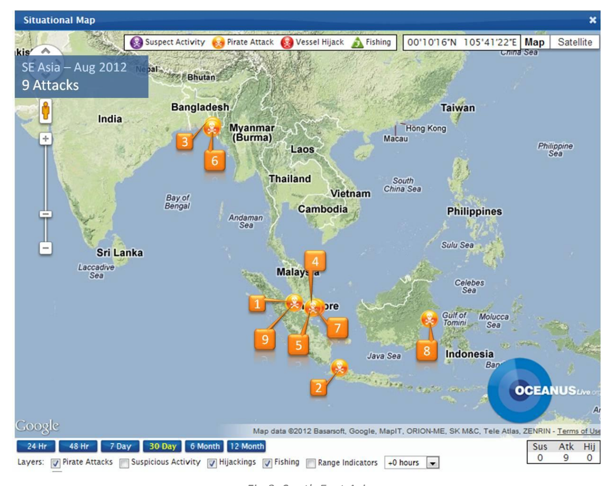
Fig 3: South East Asia