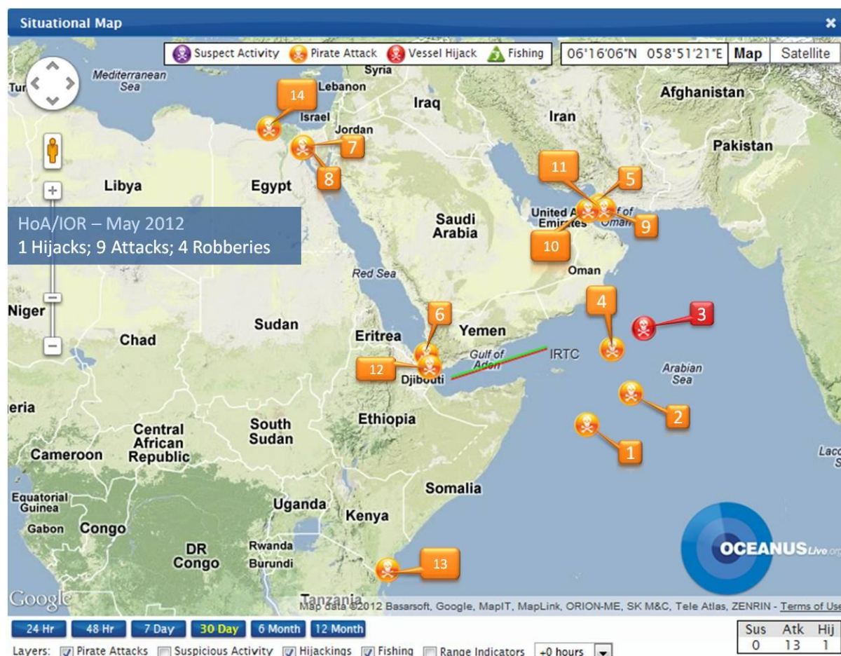
Fig 1: Horn of Africa/Indian Ocean Region