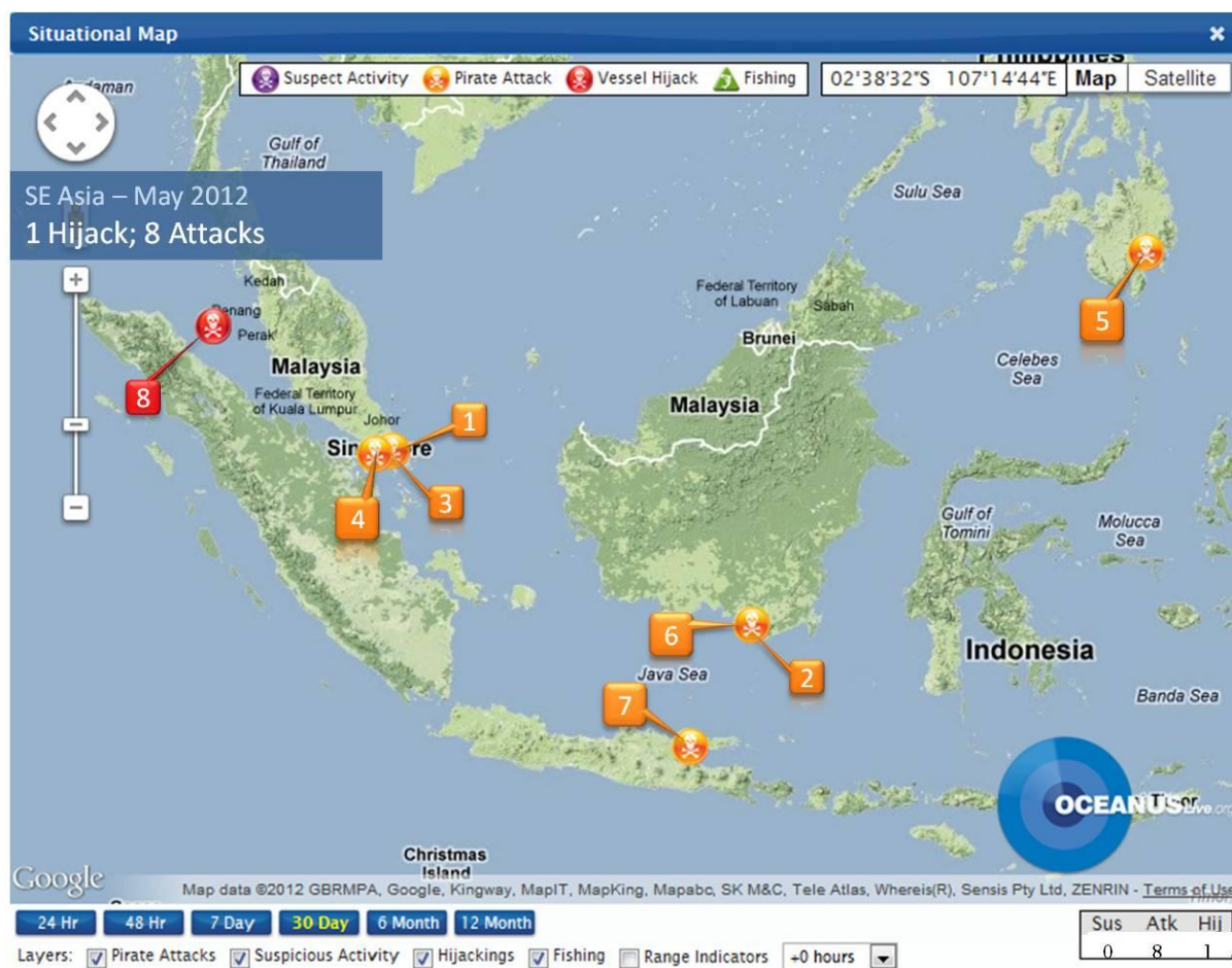
Fig 3: South East Asia